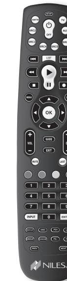
HAND-HELD LEARNING REMOTE CONTROL